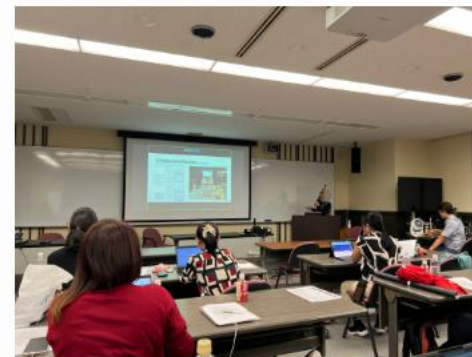
JAIST student presentation